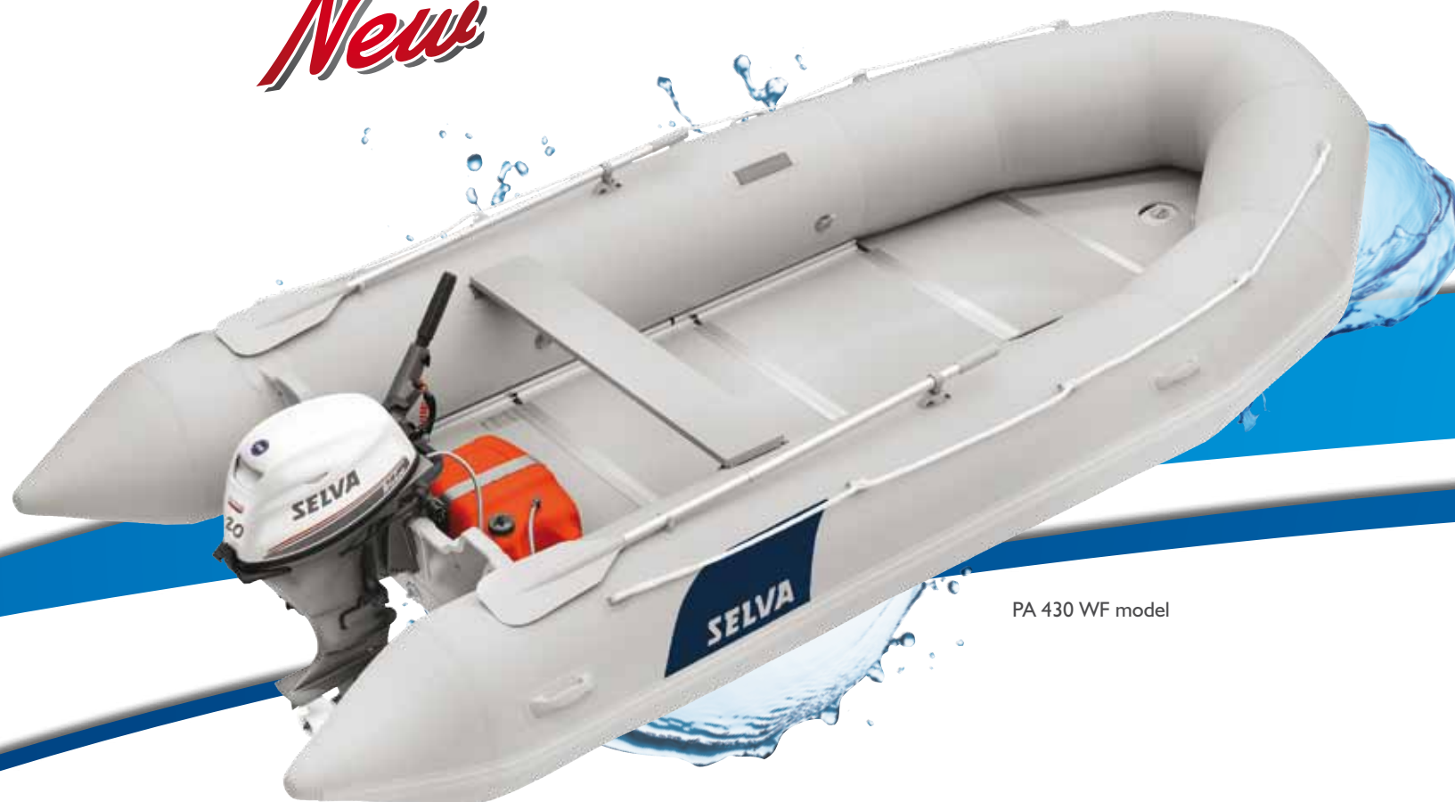
PA 430 WF model

New range of 2012, combines the comfort and spaciousness on board given by the generous size, the convenience of “all disassembling”, with the specially treated wooden floor for a perfect resistance to marine agents. The ideal boats to enjoy the sea at a very attractive costs.