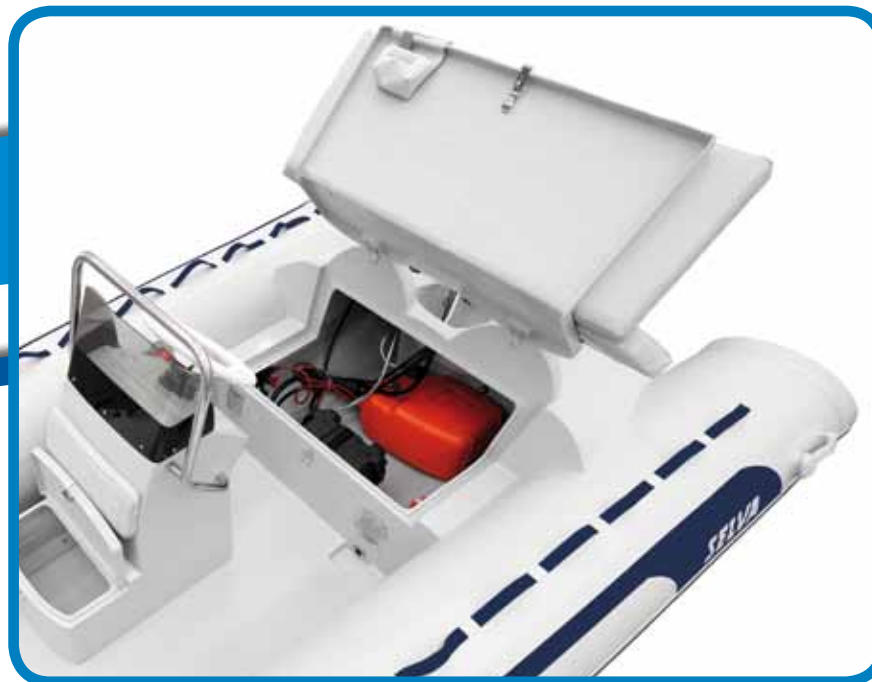
LARGE PEAKS In the DVC range, large peaks at stern, inside the console and at bow, can accommodate installations onboard and equipments for all passengers.