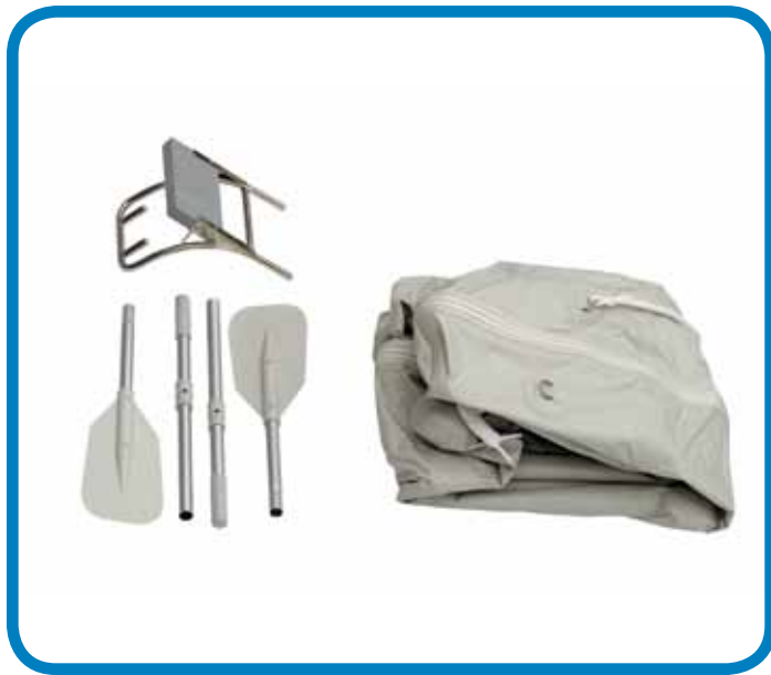
EXTREMELY LIMITED STORAGE SIZE Dismantled and folded up, it occupies the smallest storage size in its category.