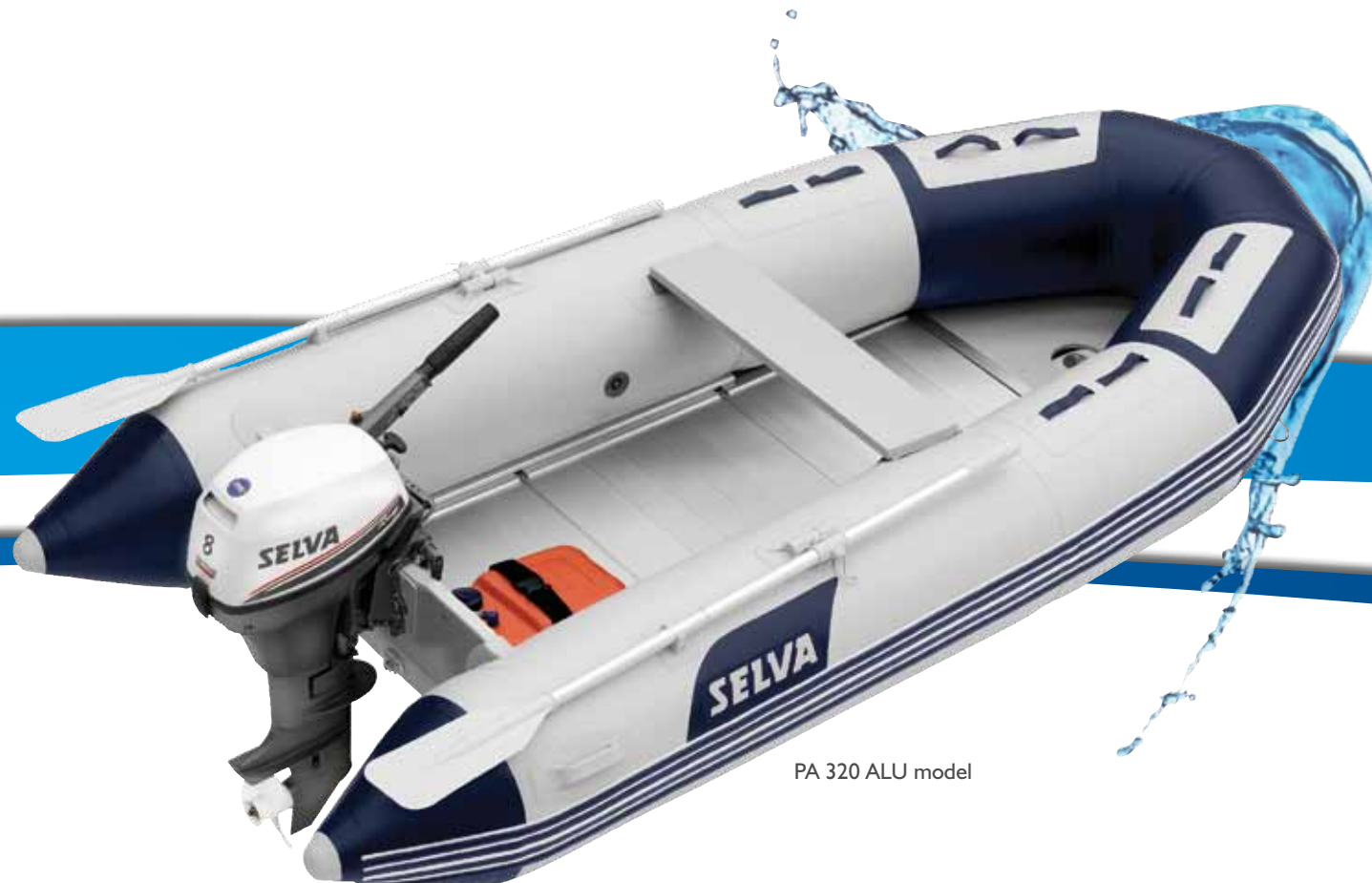
PA 320 ALU model

All the boats of the ALU (Aluminium) range are made with a fabric consisting of a polyester structure covered on both sides with PVC. Apart from being completely impermeable to water, this material is resistant to scratches and to petrol. The aluminium alloy floor gives the boats particular stability and resistance, while keeping the weight down. The practical nature of this “completely foldable” product also puts safety at the forefront.