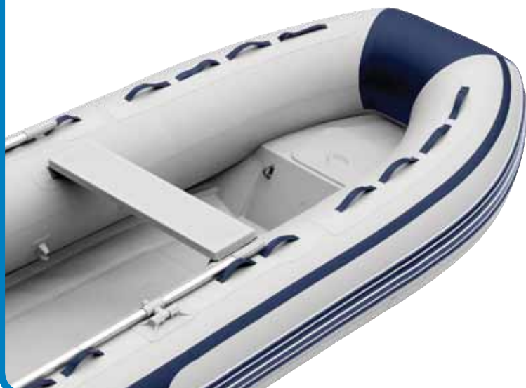
BOW LOCKER Bow locker with watertight hatch.