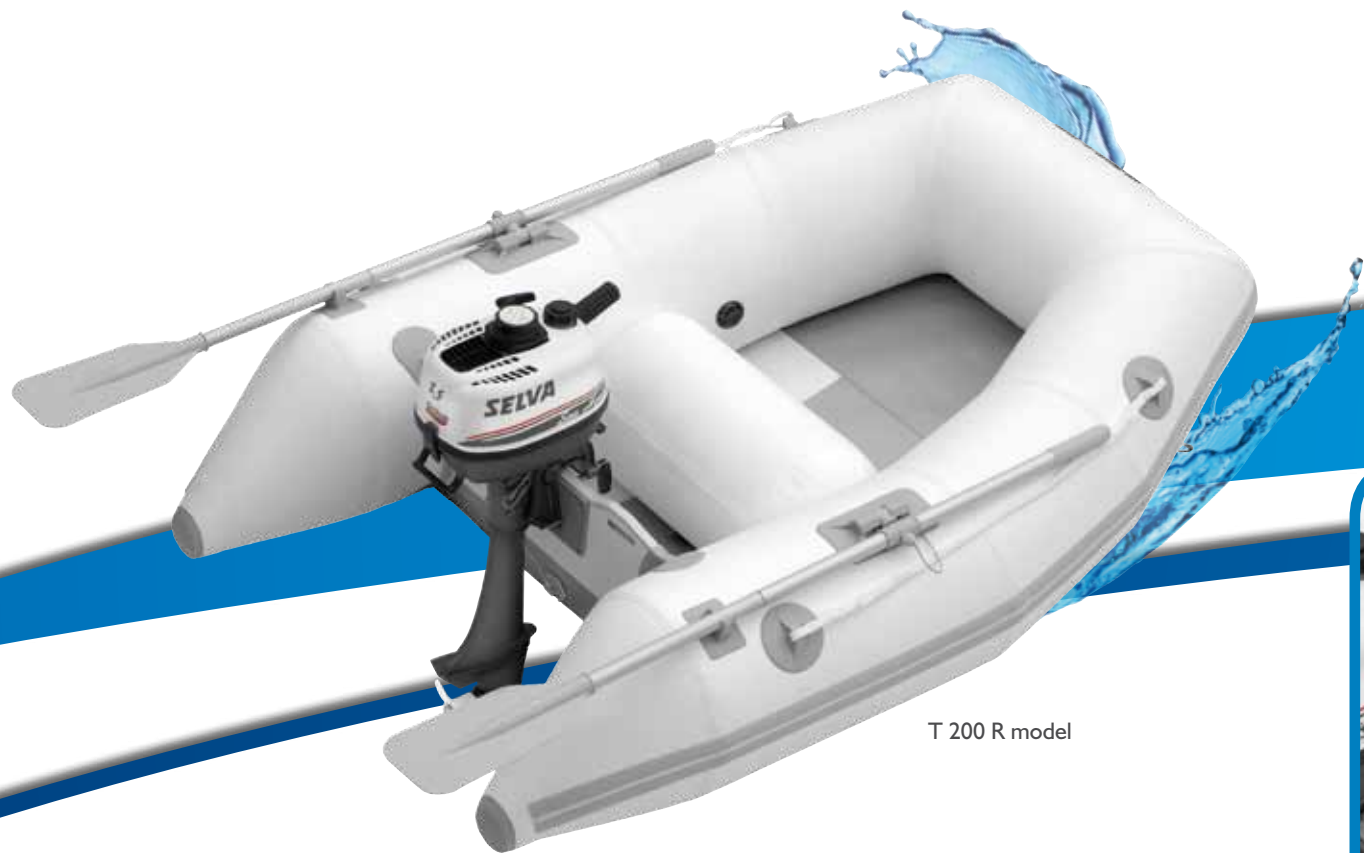
T 200 R model