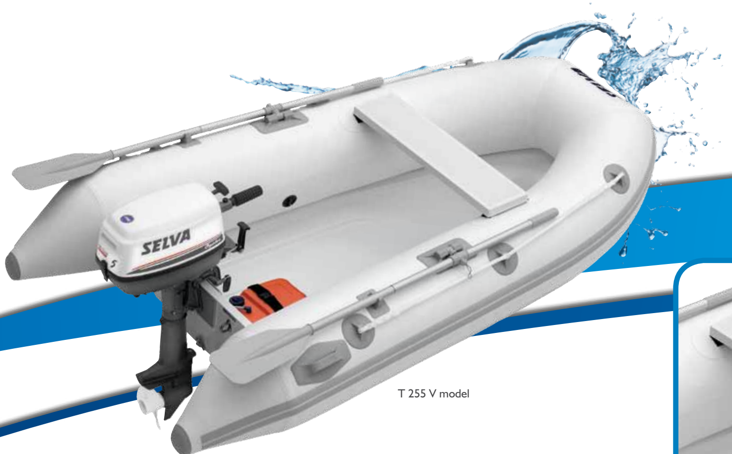
T 255 V model