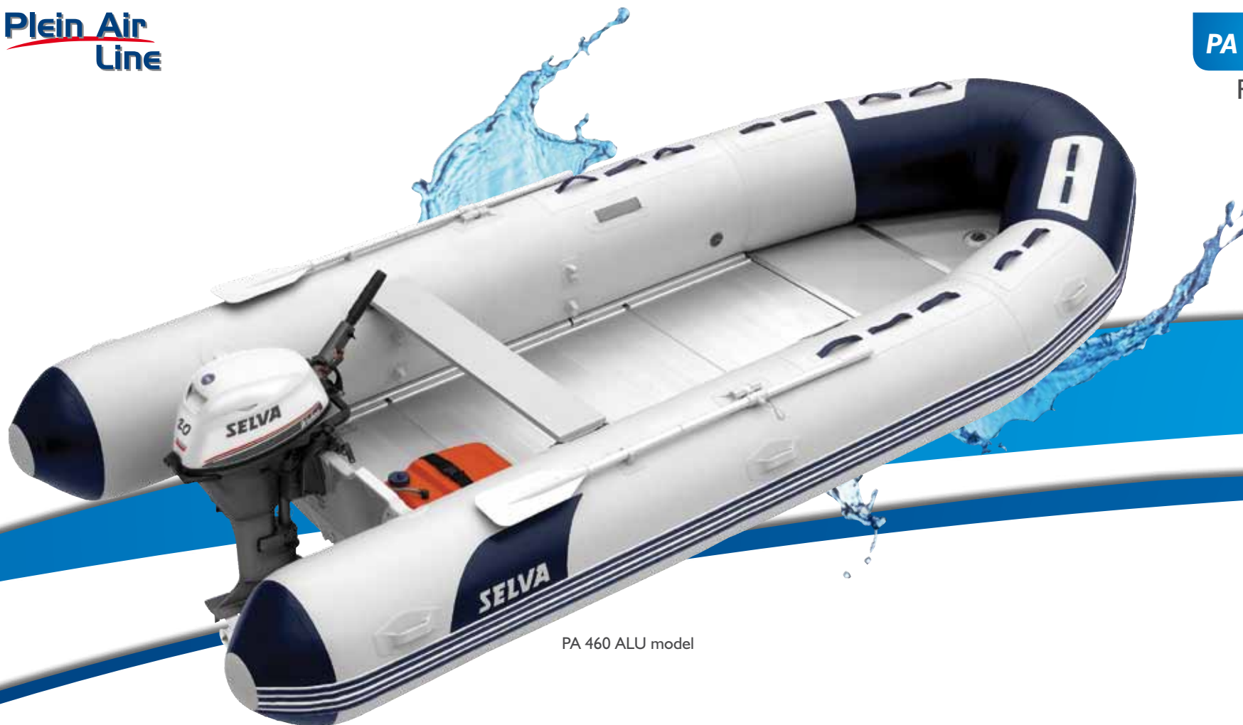
PA 460 ALU model

When you look at it closely, it would seem impossible that a boat of this size, ideal for transporting up to 8 passengers, could be transported in the boot of a car and be stored in a small space in winter. However, this flexibility does not affect its sailing safety or the accommodating capacity of the areas. The generous diameter of the tubular structures and the large size of the stern cones provide an excellent support even for long shaft motors which are quite heavy.