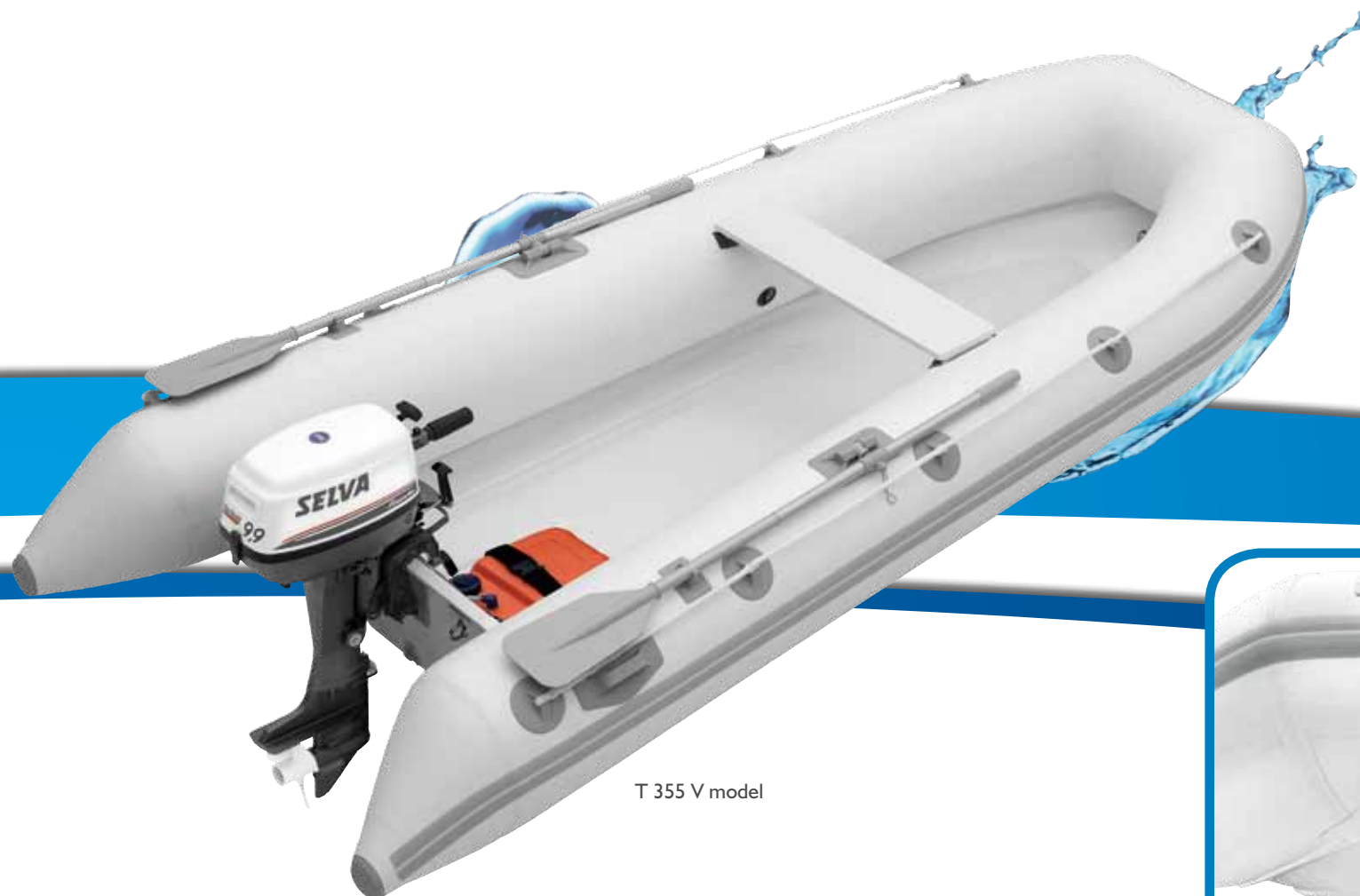
T 355 V model

The distinctive characteristic of the entire range is the elegant white colouring with clever detailing in grey rubber. Other features include the streamlined design, the spacious interior and the maximum loading capacity. A perfect combination of beauty and practicality. All models have outboard Selva Marine engines with powers ranging up to 15 Hp. Available in both versions with and without incorporated tank.