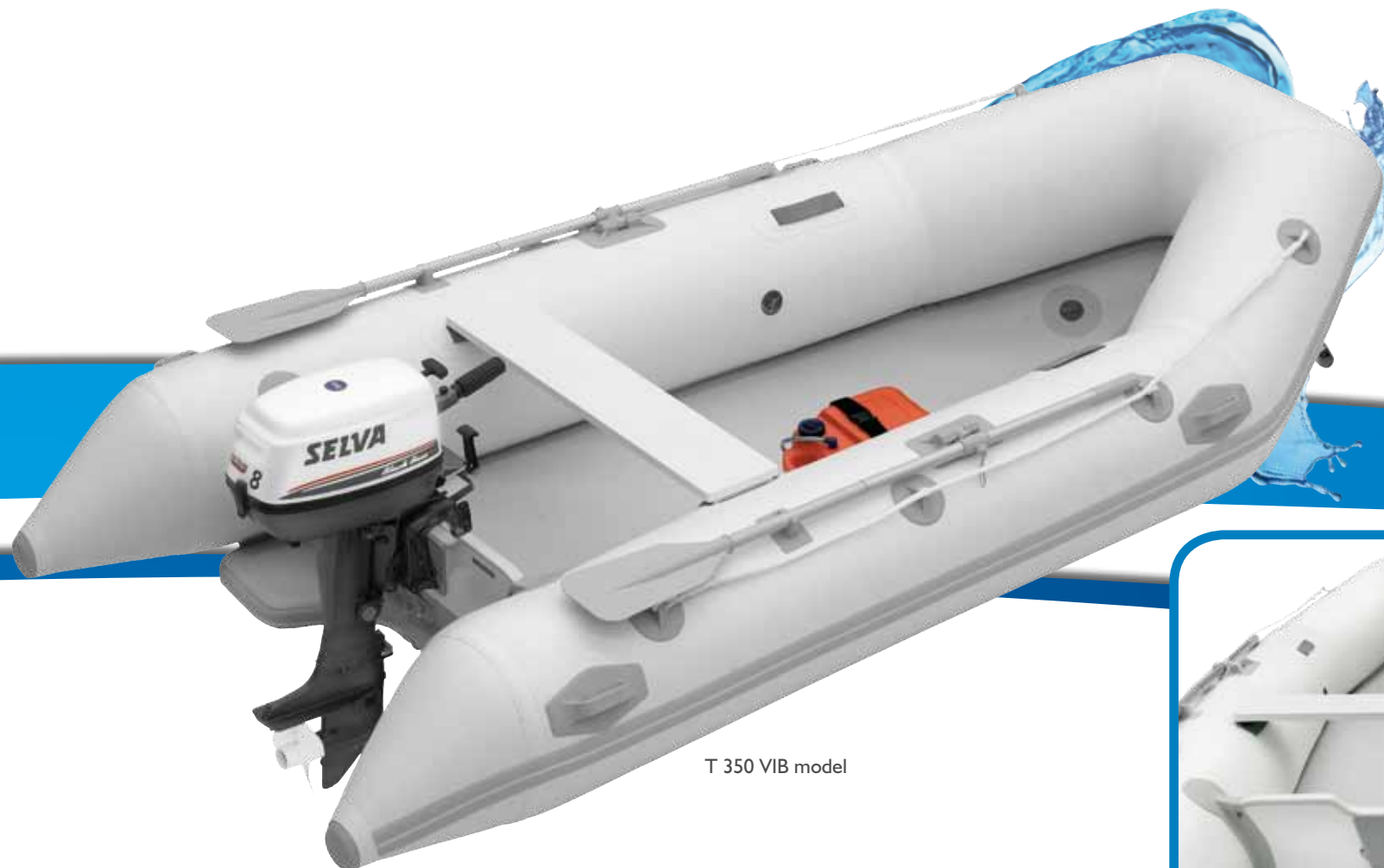
T 350 VIB model

The abbreviation VIB indicates the totally inflatable tender both as regards its tubular structures and the keel. These tenders with their generous size can be comfortably put in their carrying bag provided as standard. They are all powered with Selva Marine outboard motors in both versions with and without incorporated tank.