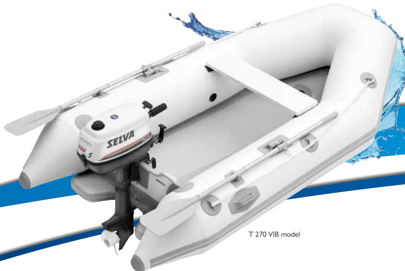
T 270 VIB model