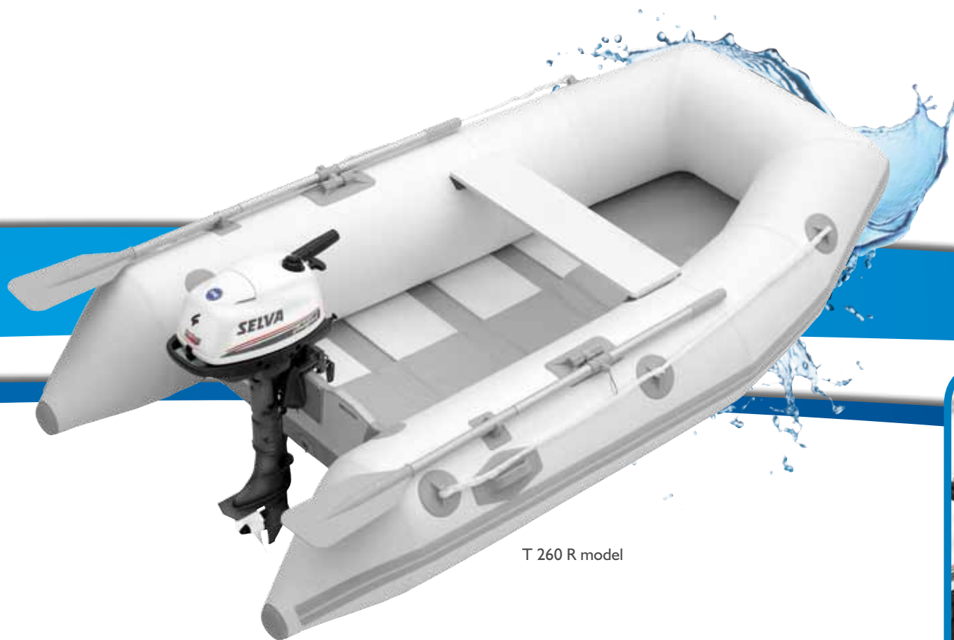
T 260 R model

With large sized board flooring. Or how to make small boats, which give their best of themselves thanks to their practicality, easy to manage but safe and comfortable in movement. When they are deflated they are light and easy to store; when they are in the water they are easy to handle and comfortable. All this in a few centimetres of length.