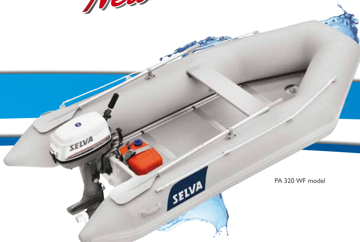
PA 320 WF model

Easy to assemble, practical transport in the two bags supplied, safety at sea with wooden floor, held by the aluminum spars, which give a greater rigidity and stability to the boat. To live passion for the sea safely and at low prices.