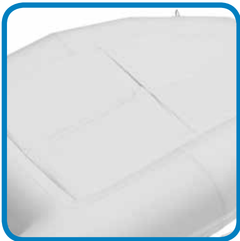
FLOOR This boat features a painted wooden floor that is glued to the keel fabric and becomes part of it. Divided into 4 parts, it means that the boat can be folded up and, at the same time, guarantees total reliability.