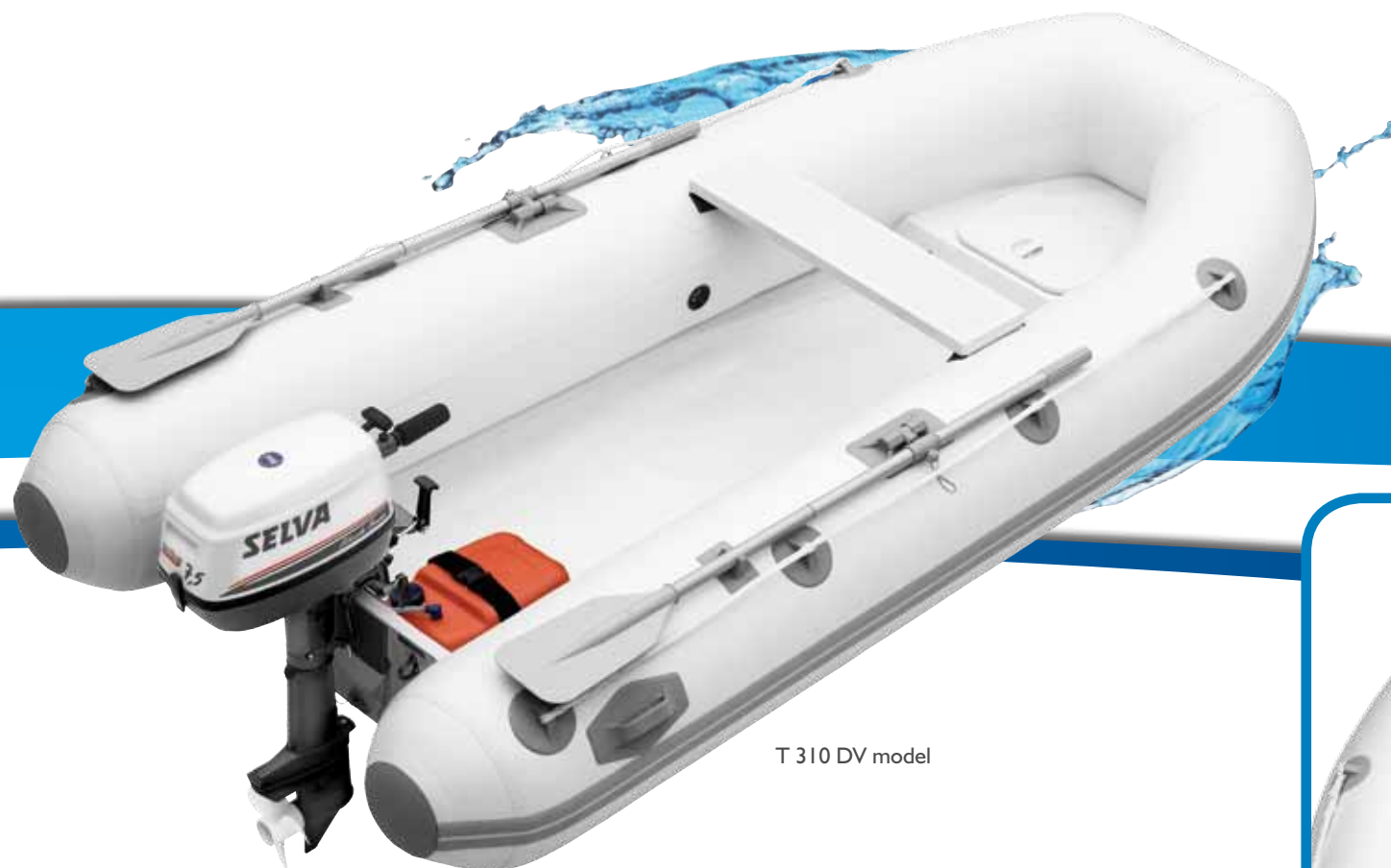
T 310 DV model

This range blends the practicality, safety and reliability typical of boats with a fibre-glass hull with the greater structure and convenience of the double moulded deck which with the horizontal walking area, increases the comfort for the passengers and easily holds the fuel tank and the on board equipment, which can also be stored in the locker with watertight storage at the stern of the boat.