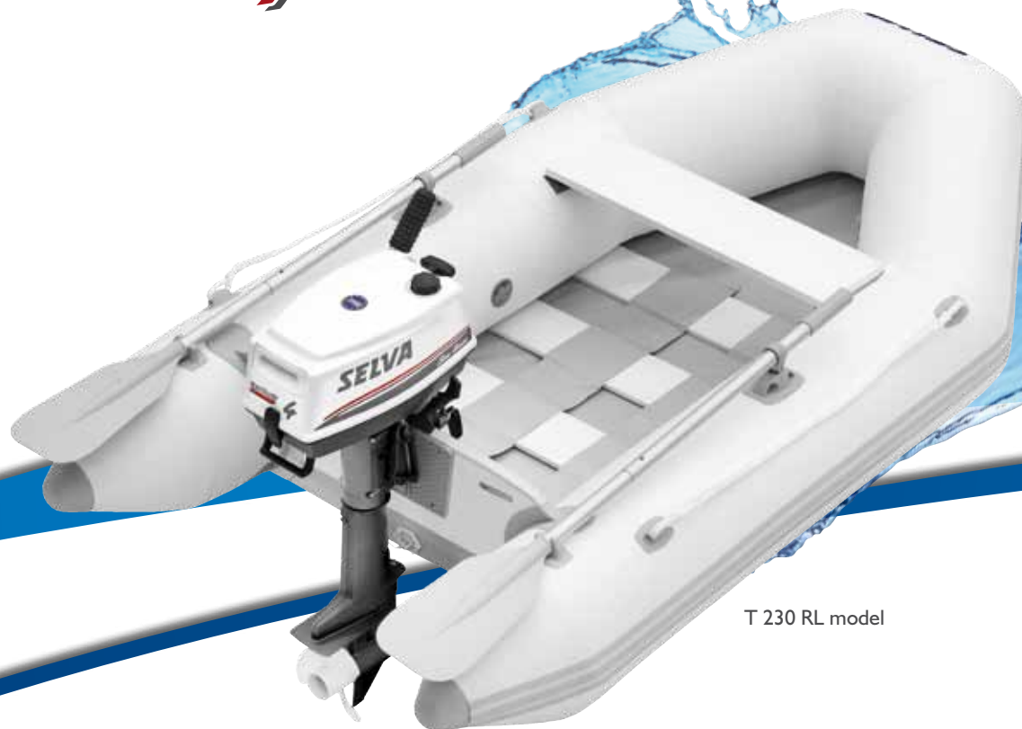
T 230 RL model