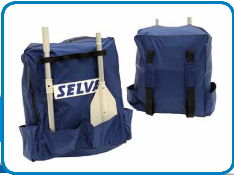
CARRYING BACKPACK The specially supplied backpack can be used to transport the boat and its accessories.