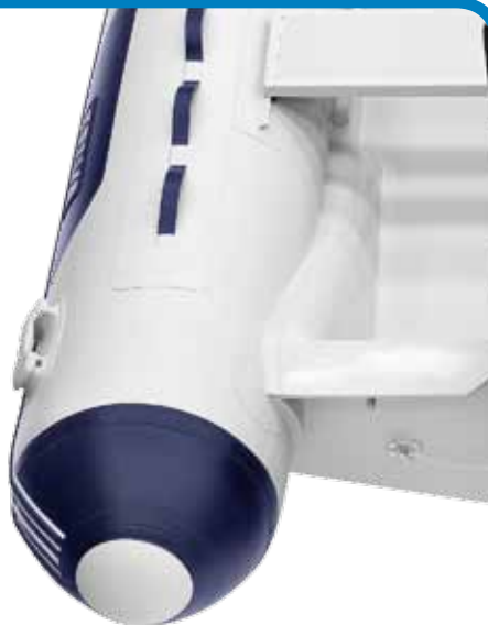
CONES Large cones with strengthened plug.