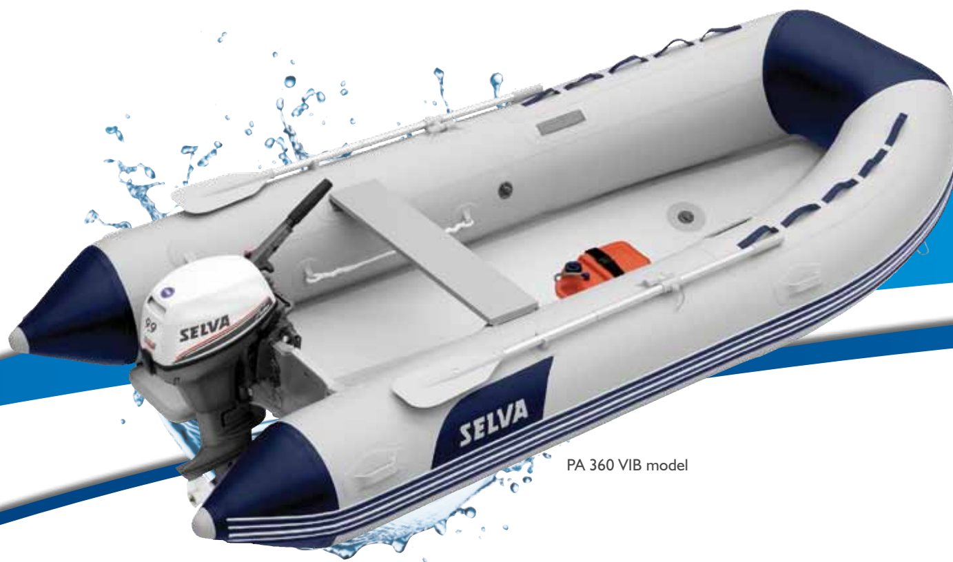
PA 360 VIB model

Totally inflatable both at tubular structure and keel level. Impeccable performance guaranteed thanks to the built-in “flaps” and high pressure (0.8 bar) V-shaped keel: light and easy to store when deflated, reliable and safe like a FRP keel when inflated. They are all powered with Selva Marine outboard motors in versions with built-in tanks for simple, practical use.