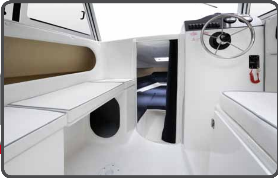
CABIN F7.0 CABIN