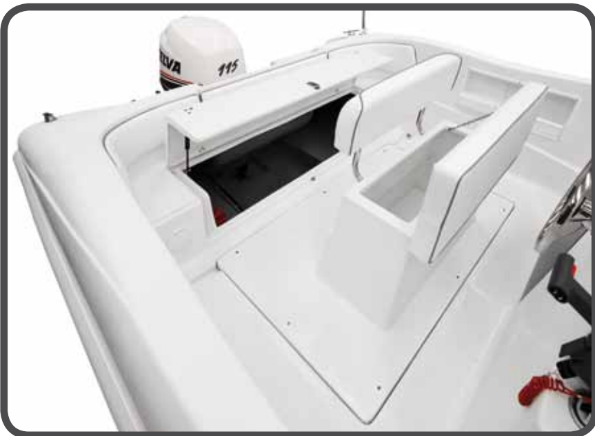
LOCKERS Practical lockers, under pilot seat and aft, may easily accommodate the installations and on board equipment.