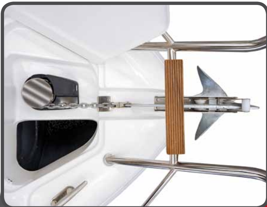
ANCHOR WINCH Boat is equipped with an anchor winch with anchor and chain.