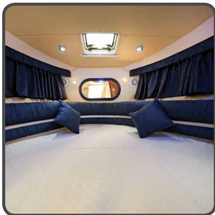
The forward cabin includes a double bed which can be converted into a U-shaped sofa, storage pockets, mirror, hatch with curtains, a spotlight and courtesy lights.

The cabin is spacious and comfortable. finely furnished with wooden furniture and enriched by a variety of amenities.