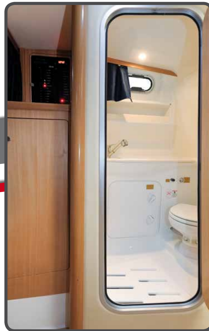
TOILETTE The toilet is equipped with an electric WC, a sink with removable tap mounted on a Corian countertop, mirror and stainless steel towel rail.