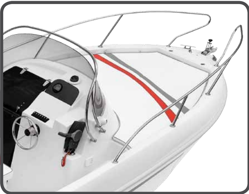
SUNBATHING ON THE DECKHOUSE The deckhouse is arranged to an extended sunbathing complete of cushions.