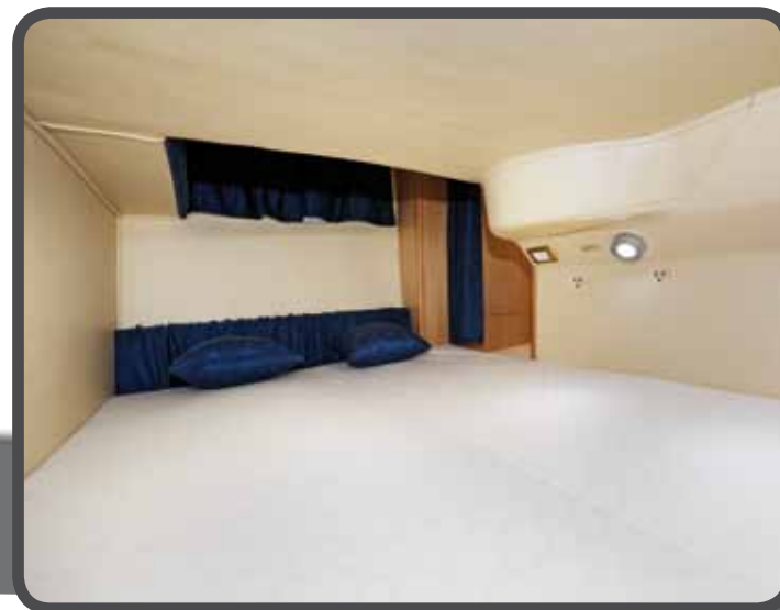
The aft cabin includes a double bed, portlight with curtain, lighting system and courtesy light.