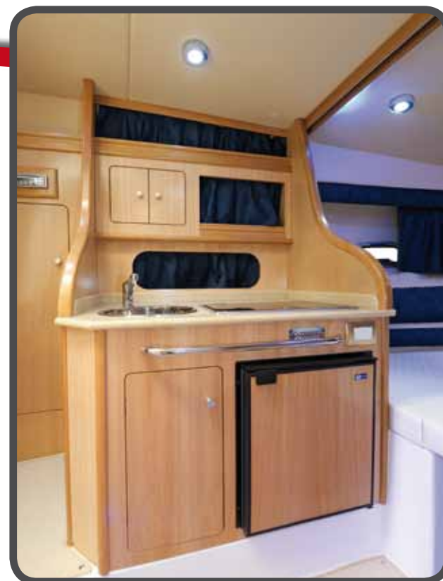
The kitchen furniture, the wooden table with Corian platform, includes a sink with tap, two burner gas stove, a 65 lt refrigerator and various cabinets and cupboards.