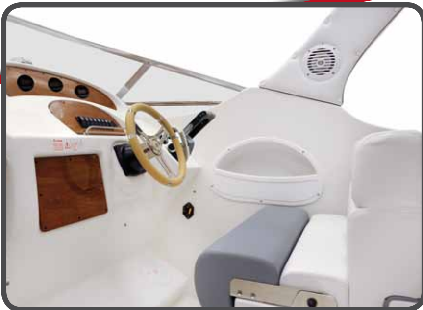
DRIVING PLACE The wide bridge with its wraparound windscreen provides a housing for the onboard instrumentation and motor controls. The pilot's seat allows for driving in a seated and standing position.