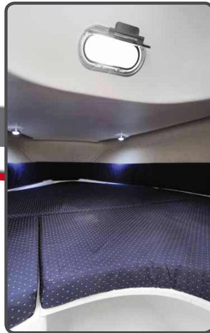
CABIN The cabin includes a double bed complete with mattresses, holding pocket that runs along all sides, a porthole and courtesy lights. It can host an optional toilet.